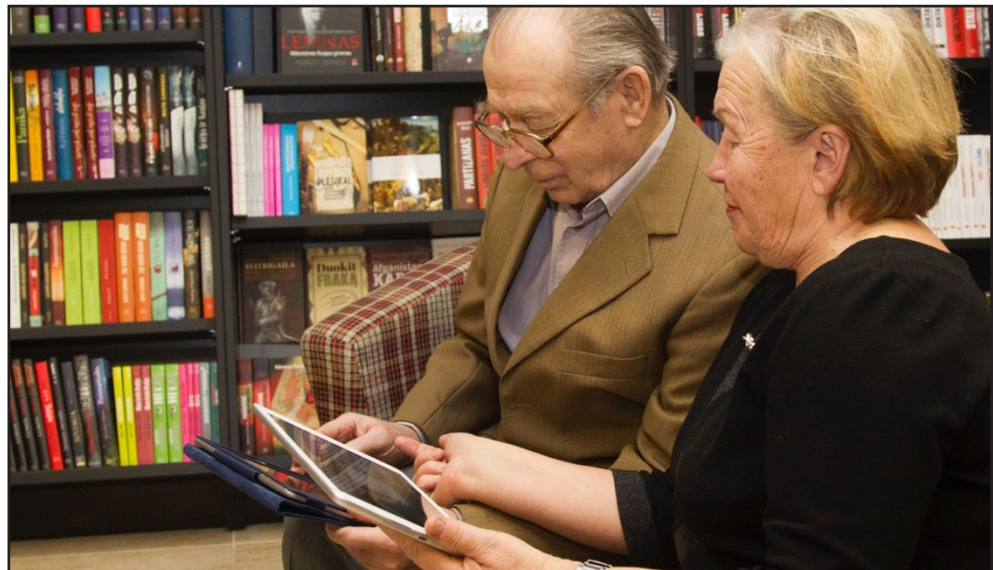
Digital inclusion, digital opportunities, quality of life.