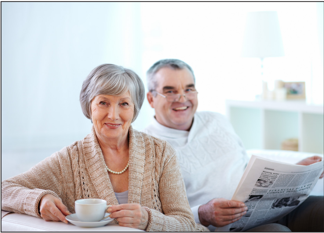
Senior needs. Promotion of digital inclusion.

The Seniors@DigiWold is developing the course that will be offered in fa-ce-to-face sessions and blended. It is open to any person that wants to offer tablet training to senior learners. We expect to increase trainers skills and competences, create re-usable materials and a social community, so every-body can take advantage of the training materials.